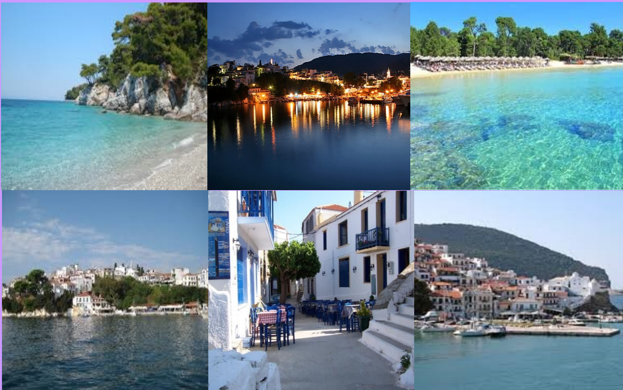
Photos of the islands of Skopelos, Skiathos and Alonissos, accessible from Volos

You can visit the islands by ferry or by flying cat from Volos. Please make your own Reservations. Please check www.hellenicseaways.gr .